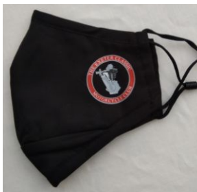
Face Mask £7.50