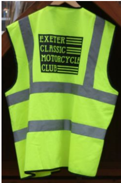
Hi Vis Waistcoat £5

Pete White holds small stocks of club regalia. If you require any items please telephone or email him (see the back page of the magazine for contact details). Payment by cash or BACS.