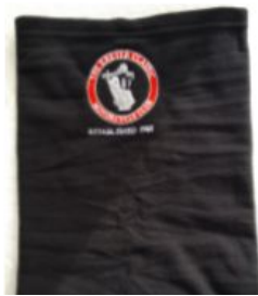
Neck Morf £8

Face mask has 2 pm2.5 filters, extra filters are 60p or 10 for £6. Free delivery Exeter area or £1.25 post per item.