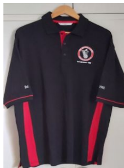
Polo Shirt £20