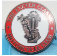
Lapel Badge £5.50 (40mm)