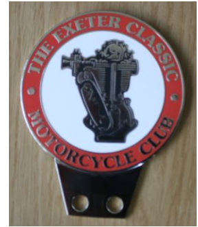
Machine Badge £15 (70mm)