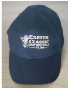
(In black or green) Baseball Cap £5